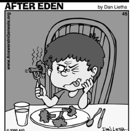
Little Edmund had to keep reminding himself that broccoli was originally created "very good".