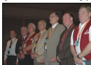
Installation of Board of Directors and other Officers

LAP graduates be ordained, rostered, and no longer denied a “regular” call. After much discussion and a failed attempt to amend the amendment, the amendment failed along with a second amendment that addressed the word “utilize”. Resolution 1-07A passed. Resolution 1-08 ( Support for Pacific Rim Outreach Society ) then was passed overwhelmingly.