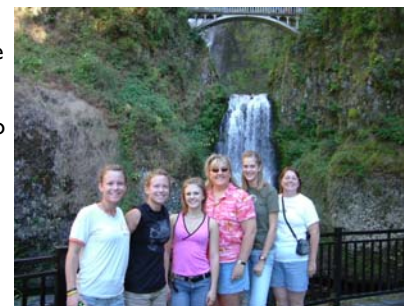
I-AM! St. John team members